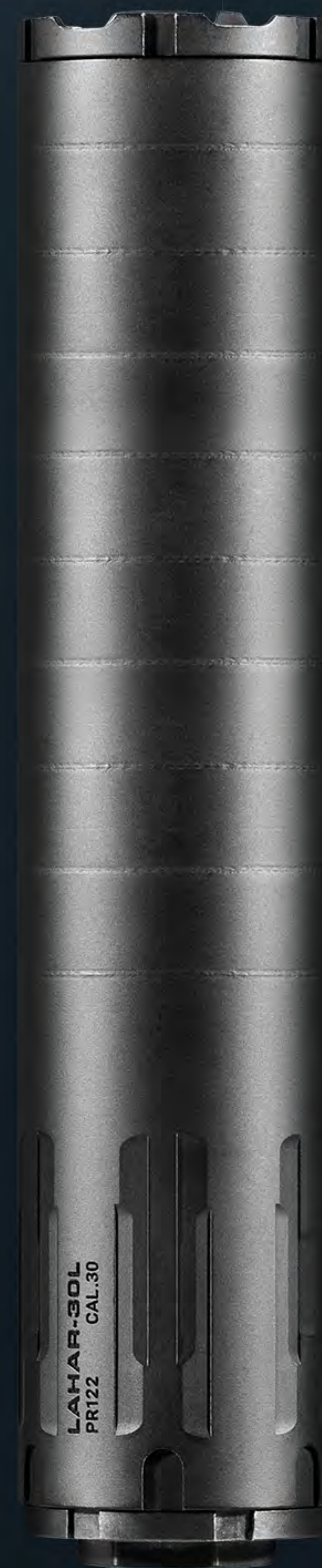
LAHAR-30L 7.7" x 1.58" – 1.32 lbs – 9 baffles Direct Thread MSRP: $749.99 Quick Detach MSRP: $999.99