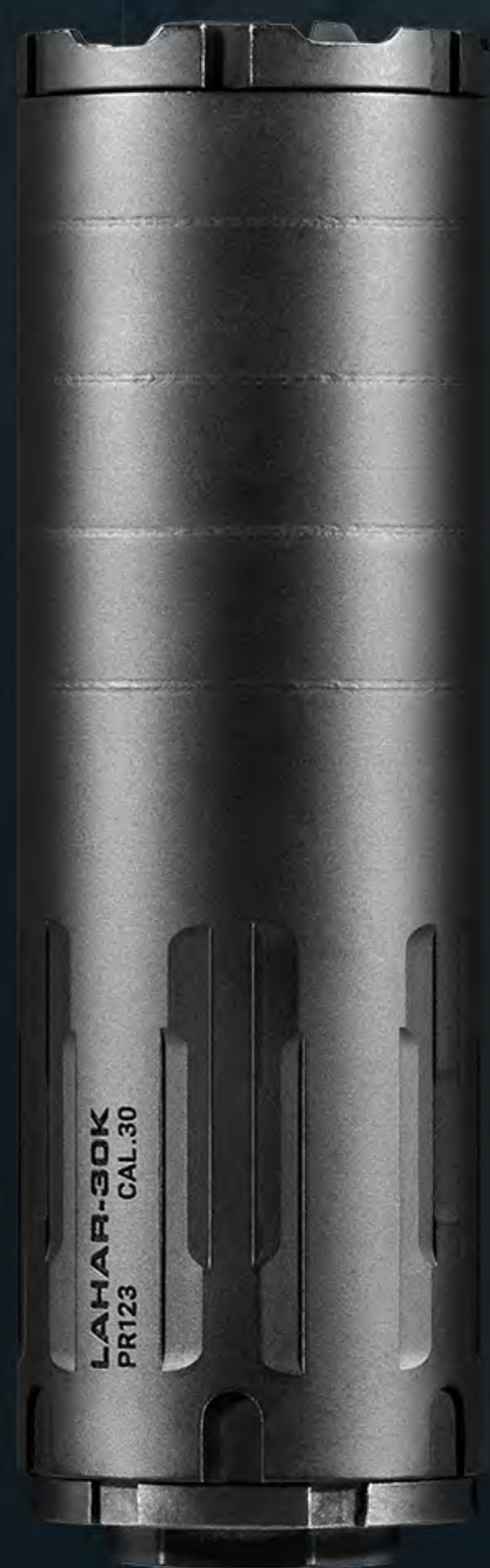
LAHAR-30K 5.1" x 1.58" – .89 lbs – 4 baffles Direct Thread MSRP: $549.99 QD MSRP: $799.99

Each Lahar-30 suppressor is backed by Aero Precision's lifetime manufacturers warranty.