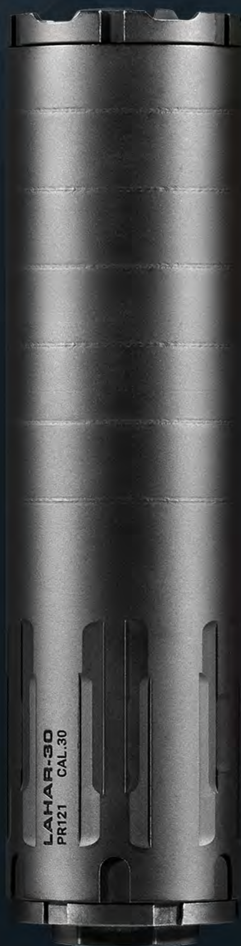
LAHAR-30 6.2" x 1.58" – 1.04 lbs – 6 baffles Direct Thread MSRP: $649.99 QD MSRP: $899.99